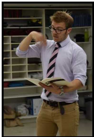
At choir practice