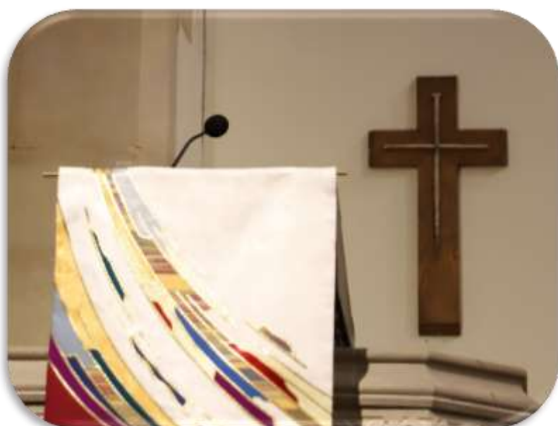
Christ Church Cathedral